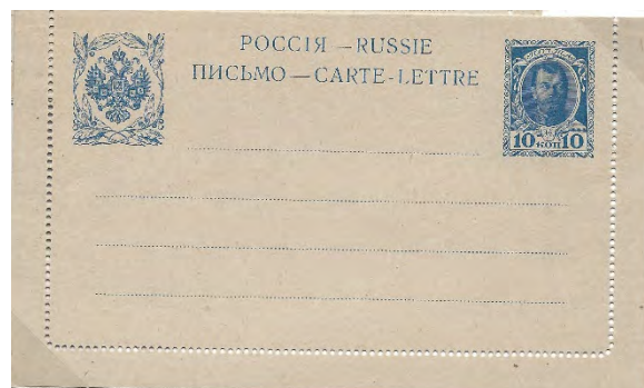
Figure 4: 10 K Mint

The incoming message is read by removing the perforated edges. See figure 4.