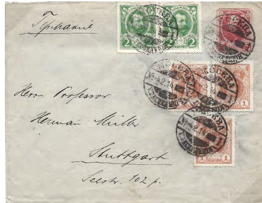
Figure 2: 3K uprated to 10K

Figure 3 shows the example I finally found. It was used in Moscow on 13 November 1913. I should be happy but it seems to be philatelic, so my search continues.