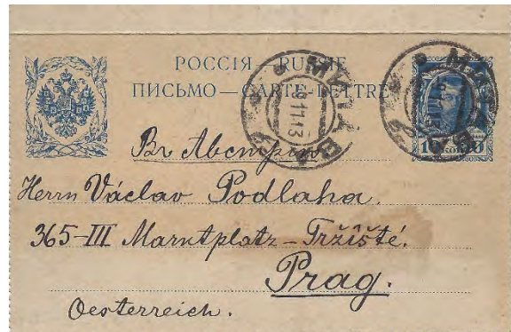
Figure 5: 10 K Used

is from Mitava sent on 19 November 1913 going to Prague in the Austrian-Hungarian Empire. It's a great item and a nice addition to my collection. I found it on Delcampe.